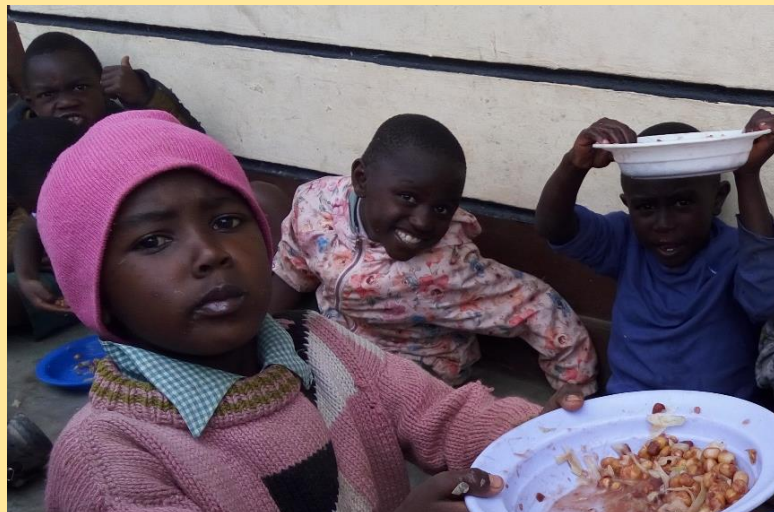
Children having lunch together in the center.