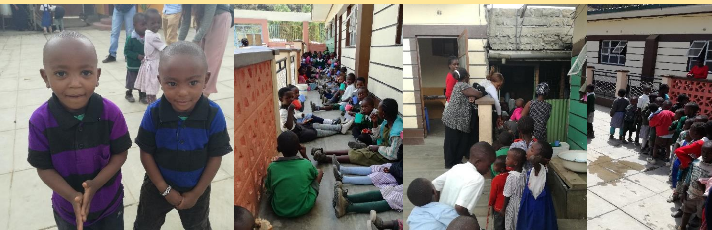
MMDC children and staff inside the building.

make it the best possible fit for the needs of its students & volunteers. Today, MMDC has four classrooms, adequate sanitation facility, a management room, a dining room and kitchen, as well as an open play area right in the center of the structure. Since the school, now, is located slightly away from the city congestion the children have enough space to play sports outside and around the school building as well. MMDC is now capable of actualizing its cause.