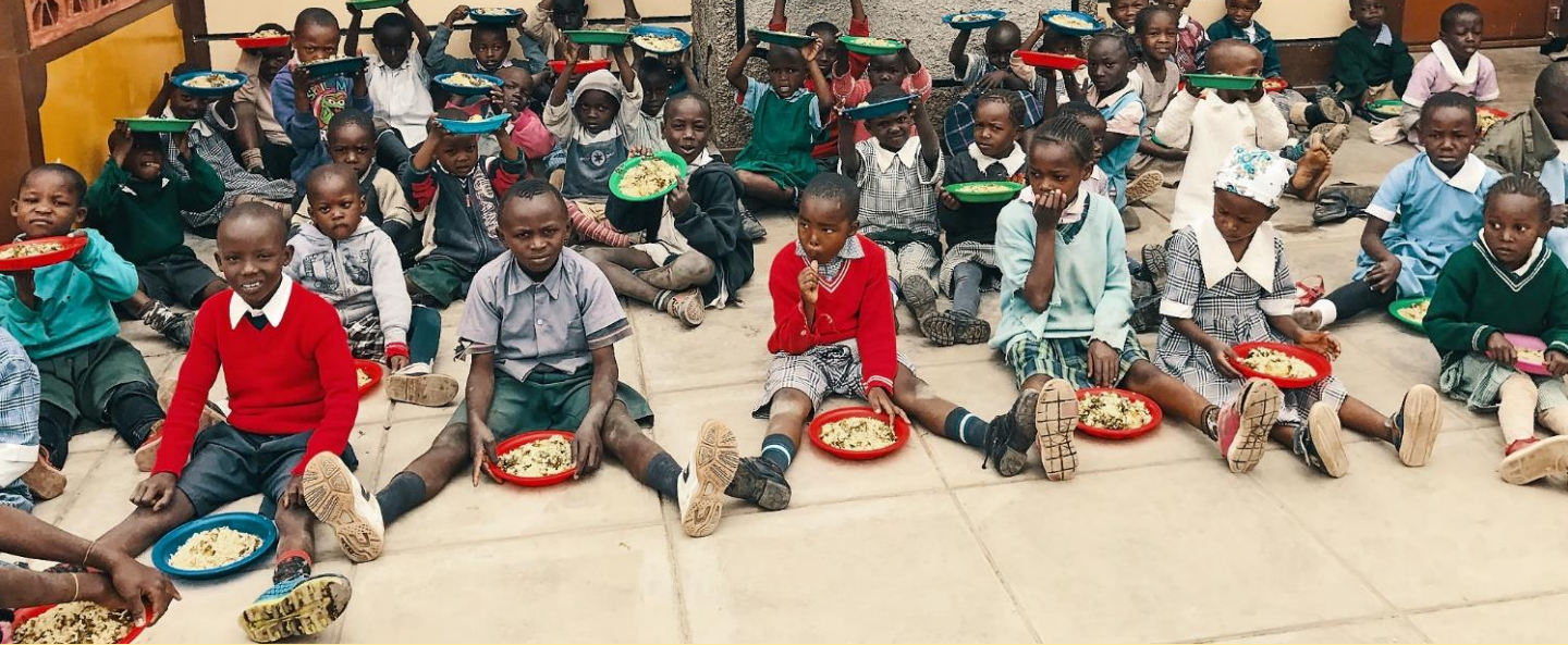
MMDC children having lunch together in play area.

Subjects include: English, Religion, Math, Swahili, Natural Science & Social Studies