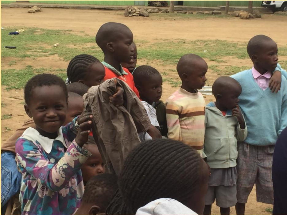
MMDC children playing outside the school campus.

volunteers from UK and USA. This helped MMDC relocate to a new place close to the Nairobi-Naivasha highway. After, purchasing the plot and making it a permanent property of the school, constructions began to optimize the place and