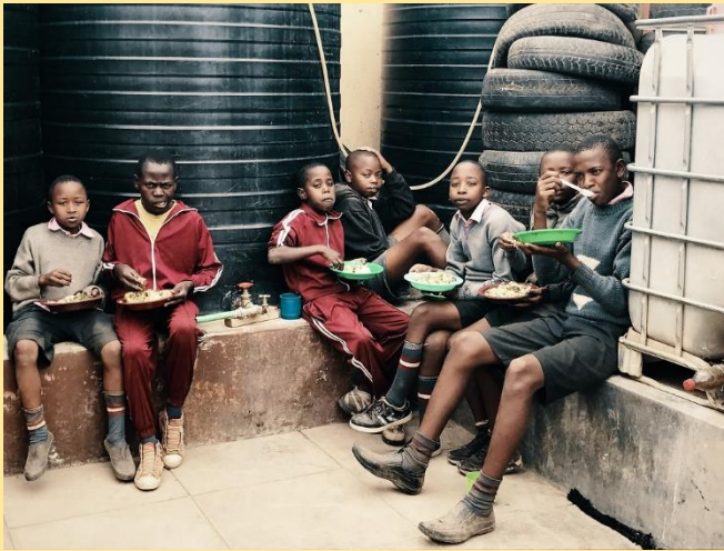
MMDC ex-students currently in government schools having lunch.

On the edge of Naivasha, where this small town meets the enormous, industrialized city of Nairobi, lies a primary school located in a small, cosy building with volunteers enthusiastically working to educate children of the neighbouring slums. Monica Memorial Development Center,