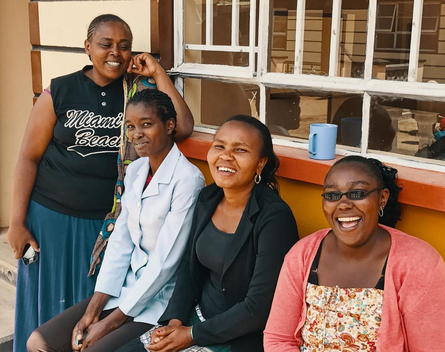
MMDC teaching faculty. The smiles say it all!

Teaching: Writing small paragraphs, learning words for vocabulary, learning about animals and geography. Activities focus on establishing a reading habit and improving reading comprehension.