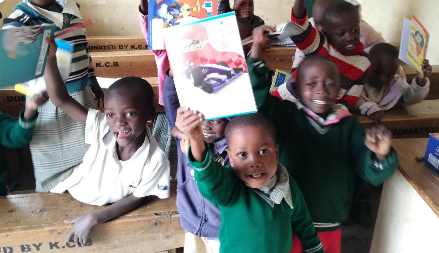
MMDC Children received gifts from friends in Hamburg.